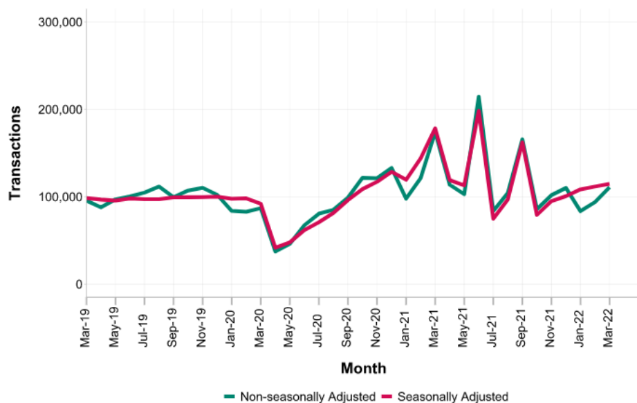
Figure 1: Non-seasonally adjusted and seasonally adjusted UK residential property transactions by month between March 2019 and March 2022, in thousand transactions.