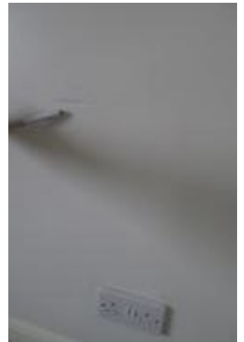
Dent approx 10cm to wall above right double socket on the wall opposite the fitted wardrobes