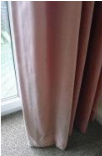
Curtains very faded to the bottom left corner with black marks