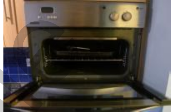
Top oven / grill