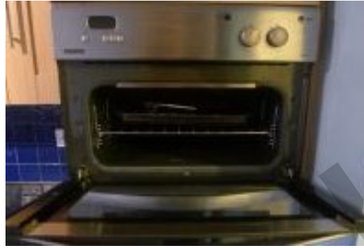
Top oven / grill