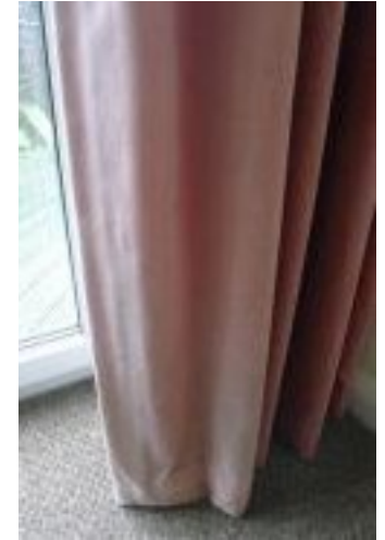
Curtains very faded to the bottom left corner with black marks