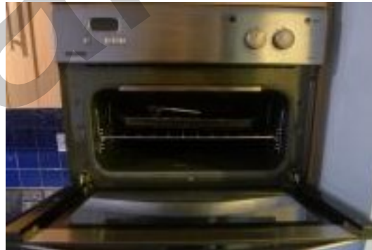
Top oven / grill