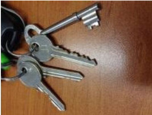
Set of keys